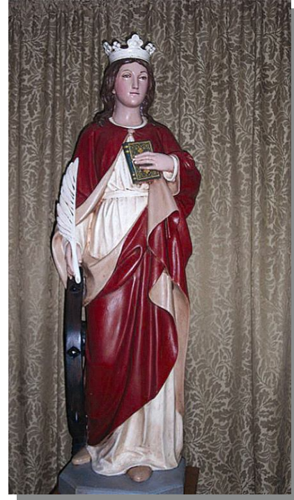
400 Columbia Street Cathlamet