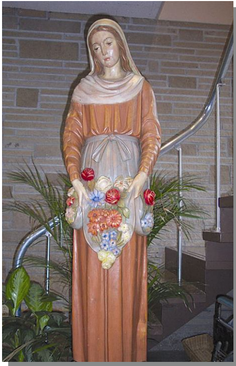
701 26th Avenue Longview