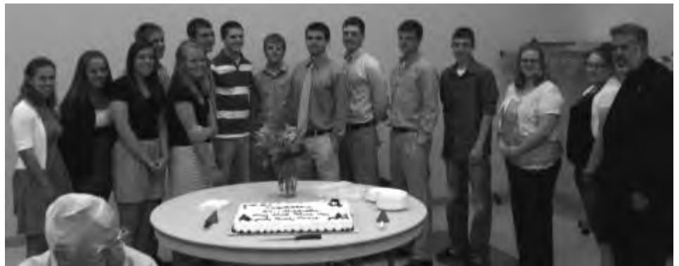
High School Senior Honor Mass and Reception The High School graduating seniors were recognized at the 8:30 Mass on May 15th. They served in various ministries at the Mass. A reception was held in Fellowship Hall, in conjunction with Fellowship Sunday.